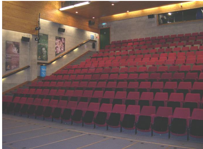
RYAN CENTRE THEATRE, STRANRAER

Tickets sold for this event will be for unreserved seats – Because the Ryan Centre Theatre has raked seating, disabled patrons may wish to request us to reserve seats in row A ( no steps involved to reach these seats ) – Please advise us at time of ordering tickets with this request.