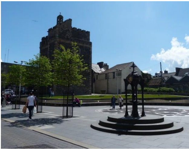
CASTLE SQUARE, GEORGE STREET – STRANRAER TOWN CENTRE

There's a lot going on in this old ferry town. With a population of around 13,000, Stranraer is Dumfries and Galloway's second largest town.